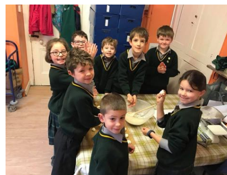
Year 3 cooking up some yummy goodies!