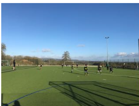
A sunny U8 and U9 football match