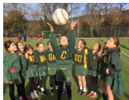
U9 Girls celebrating at The Elms