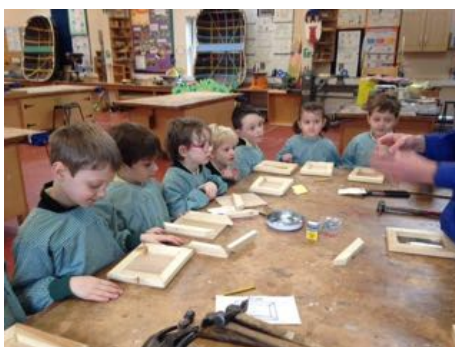
Y1 in DT making picture frames