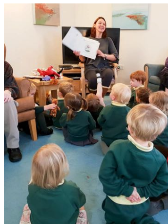
Kindergarten to Hagley Place