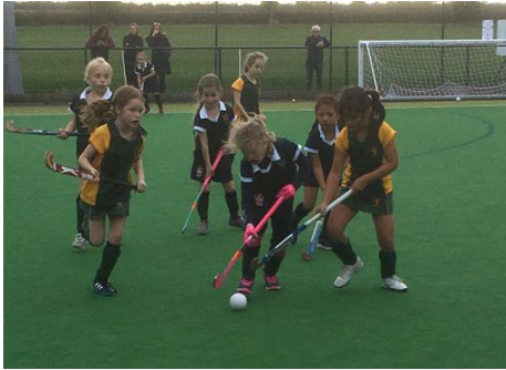
U8 matches v RGS