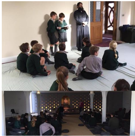
Year 6 trip to the Mosque