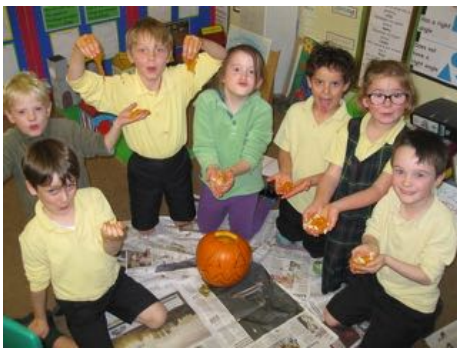
Year 2 Pumpkin Carving