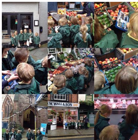
Reception trip to Ludlow