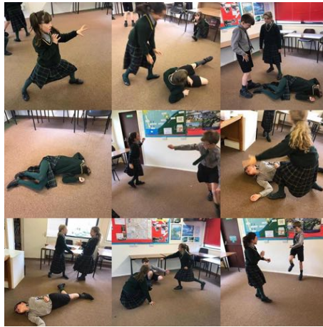
Y5 The Jabberwocky