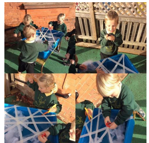
Incy Wincy Spider play