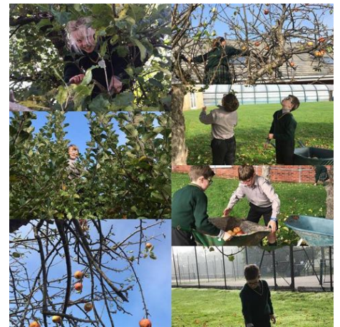
Apple picking and pressing