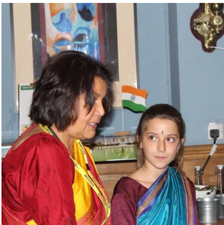
Indian Night on Boarding