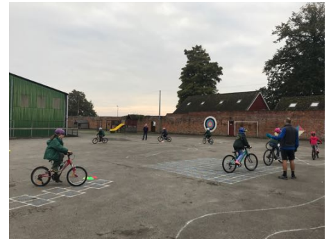
Saturday Smash Bikeability