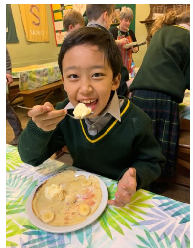
Pancake night on boarding.

Kindergarten have been carrying out acts of kindness for Lent. Among other things they have been hiding bookmarks with kindness messages on them in the library for the older children.