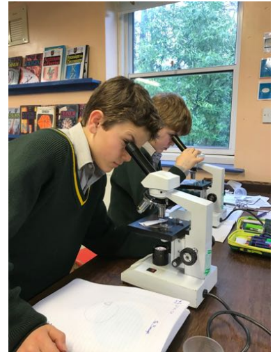
Year 6 Carrying out scientific research!